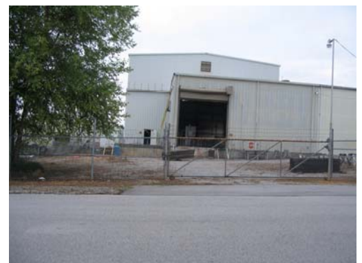
Side View – Truck Height Door

Offices are in an adjacent 1,540 SF building. Level corner lot measuring 240' x 160'