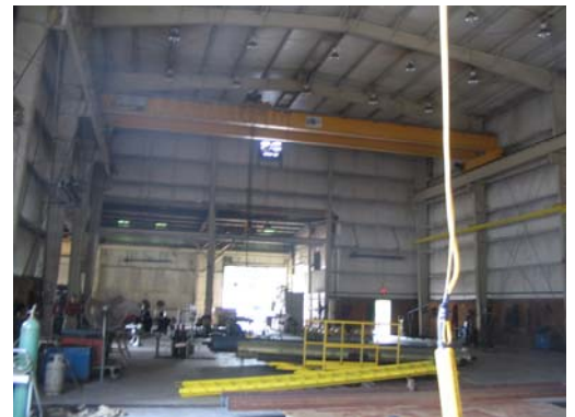
40' Ceiling With Cranes

5 blocks from Amnicola Highway which is a major 5-lane artery with various major industrial companies. Amnicola connects the Central Business District to the new Volkswagen Plant, about 10 miles northwardly.