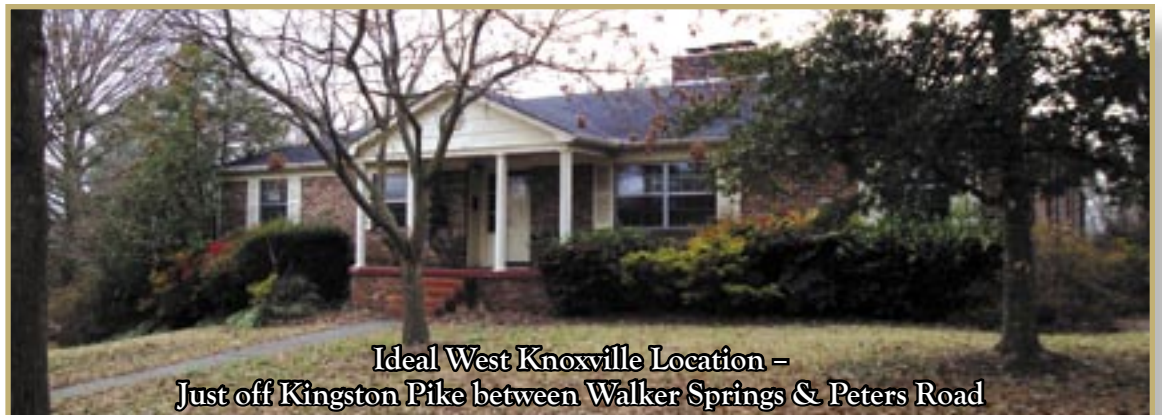
Ideal West Knoxville Location – Just off Kingston Pike between Walker Springs & Peters Road