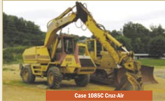
Case 1085C Cruz-Air

TERMS: 10% Buyer's Premium on all items $2,500 or less. 5% Buyers Premium on all items $2,501 or more. Additional 2% for on-line buyers. Cash, Cashier's Check, Company or Personal Check when accompanied by a Bank Letter of Guaranty. Payment due day of sale.