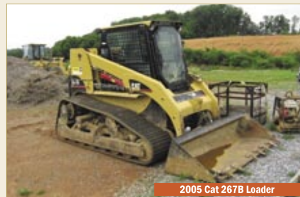
2005 Cat 267B Loader