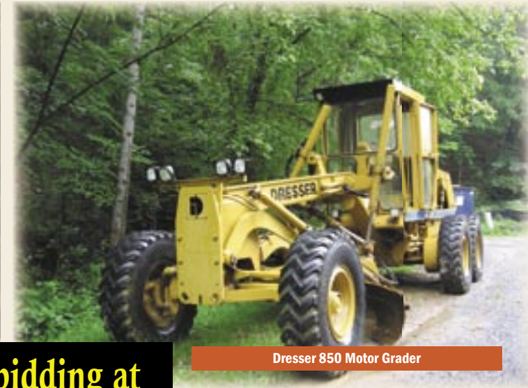
Dresser 850 Motor Grader