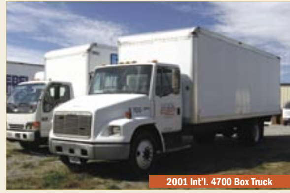
2001 Int'l. 4700 Box Truck