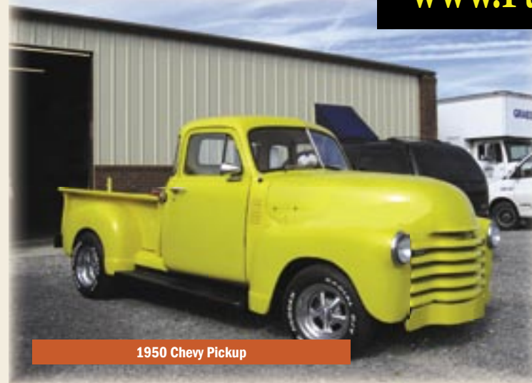
1950 Chevy Pickup