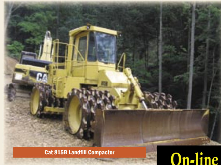
Cat 815B Landfill Compactor

Inspection: Friday, November 13 • 8:30 AM - 5:00 PM