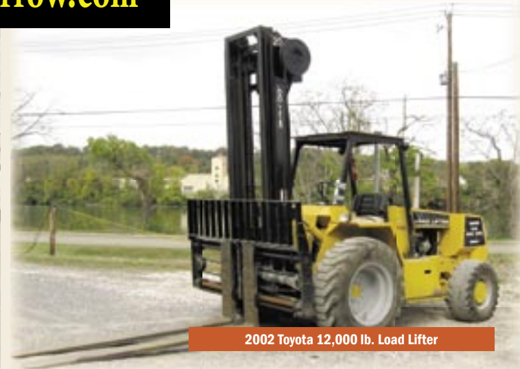
2002 Toyota 12,000 lb. Load Lifter

• Construction • Trucks • Trailers • Farm • Support Equipment Chilhowee Park & Exposition Center, Knoxville, TN Saturday, November 14 • 9:30 AM Inspection: Friday, November 13 • 8:30 AM - 5 PM