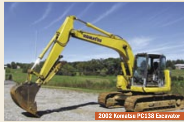
2002 Komatsu PC138 Excavator