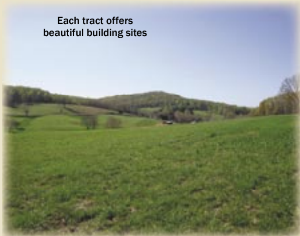
Each tract offers beautiful building sites