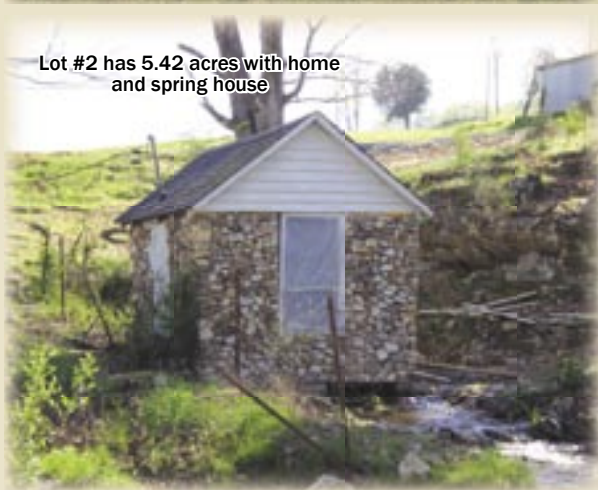
Lot #2 has 5.42 acres with home and spring house