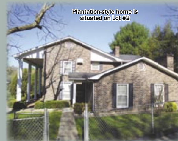
Plantation-style home is situated on Lot #2