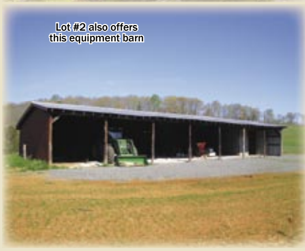
Lot #2 also offers this equipment barn