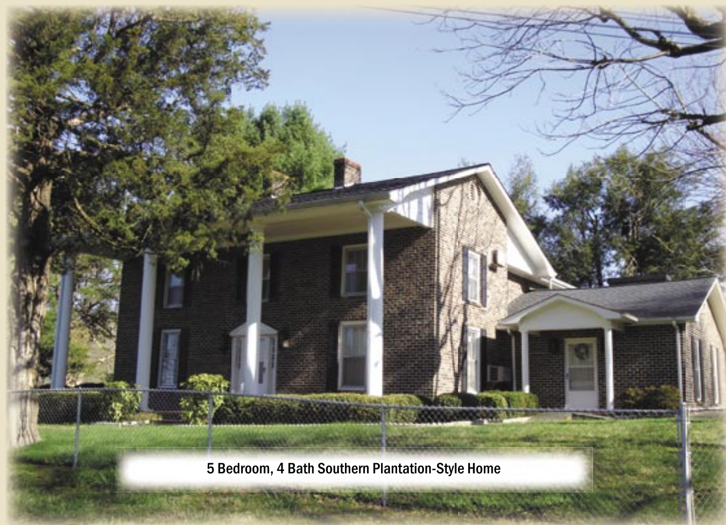
5 Bedroom, 4 Bath Southern Plantation-Style Home

Open House: Sunday, June 7 • 2:00 - 4:00 PM