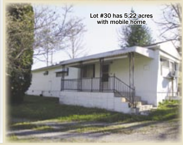
Lot #30 has 5.22 acres with mobile home