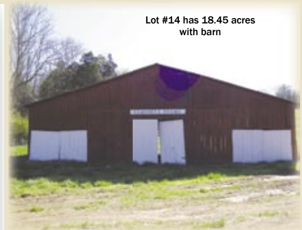
Lot #14 has 18.45 acres with barn